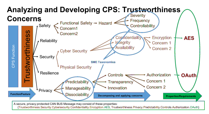
Fig. 1: Branching for Trustworthiness Concerns