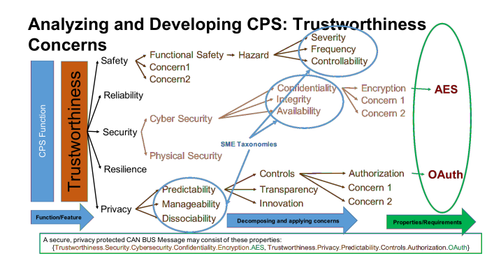
Fig. 1: Decomposition tree for Trustworthiness Concerns

The facets of the CPS Framework are sets of activities, characteristic of a mode of thinking about the development of a system. These facets are conceptualization , realization , and assurance . We refer to the CPS Framework documentation noted above for their complete explanation. The output of the conceptualization facet is a Model of the CPS , consisting of properties of the CPS with an indication of the concerns that gave rise to the properties. The output of the realization facet is the CPS itself. And, finally, the output of the assurance facet is an Assurance Case for each concern applied to the CPS . The assurance case is sorted by the concerns applied to the CPS and consists of assurance judgment(s) , comprised of: